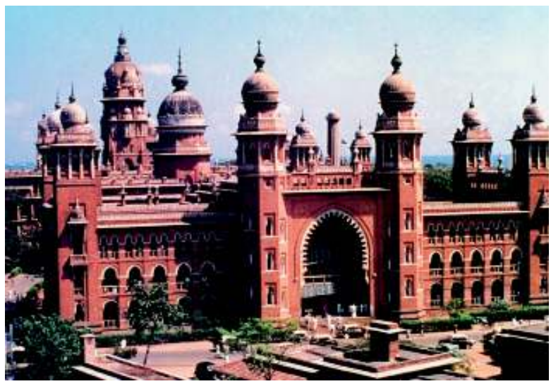
High Court of Madras

Are these different levels of courts connected to each other? Yes, they are. In India, we have an integrated judicial system, meaning that the decisions made by higher courts are binding on the lower courts. Another way to understand this integration is through the appellate system that exists in India. This means that a person can appeal to a higher court if they believe that the judgment passed by the lower court is not just.