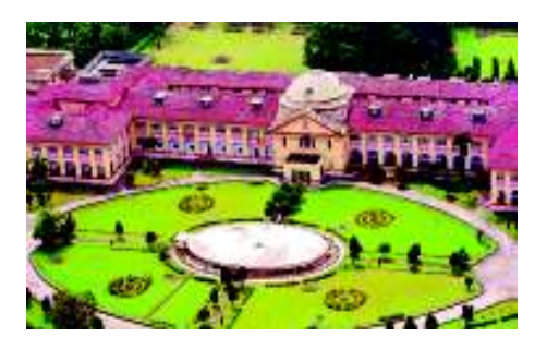
High Court of Patna

High Courts were first established in the three Presidency cities of Calcutta, Bombay and Madras in 1862. The High Court of Delhi came up in 1966. Currently there are 24 High Courts. While many states have their own High Courts, Punjab and Haryana share a common High Court at Chandigarh, and four North Eastern states of Assam, Nagaland, Mizoram and Arunachal Pradesh have a common High Court at Guwahati. Andhra Pradesh and Telangana have a common High Court at Hyderabad. Some High Courts have benches in other parts of the state for greater accessibility.