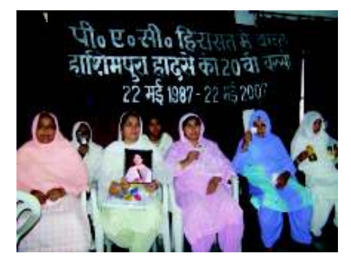
The above photo shows the family members of some of the 43 Muslims of Hashimpura, Meerut, killed on 22 May 1987. These families have been seeking justice for over 20 years. Due to long delay in the commencement of the trial, the Supreme Court in September 2002 transferred the case from the State of Uttar Pradesh to Delhi. The trial is ongoing and 19 Provincial Armed Constabulary (PAC) men are facing criminal prosecution for alleged murder and other offences. By 2007, only three prosecution witnesses had been examined. (photo was taken at Press Club, Lucknow, 24 May 2007)

In a speech made on 26 November 2014, the Chief Justice of India K.G. Balakrishnan noted that, "The Indian judiciary consists of one Supreme Court with 26 judges, 21 High Courts with a sanctioned strength of 725 judges (working strength of 597 as on 1 March 2007) and 14,477 Subordinate courts/judges (working strength of 11,767 as on 31 December 2006)."