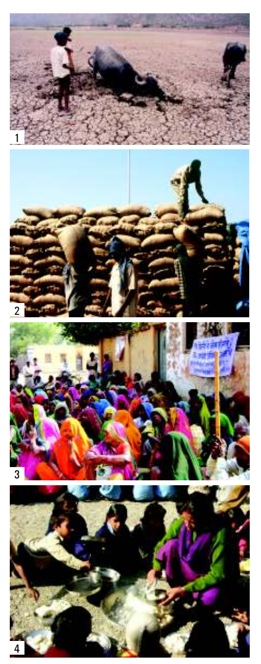
Photo 1. In 2001, the drought in Rajasthan and Orissa meant that millions faced an acute shortage of food.

Did you know that the mid-day meal that children now receive in government and government-aided schools is because of a PIL? See the photos on the right and read the text below to understand how this came about.